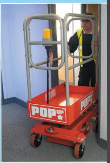
...IN AND OUT OF DOORS...